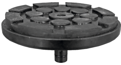
MOUNTING SUPPORT A1 4X