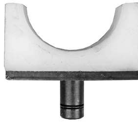
MOUNTING SUPPORT A2 4X