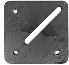
BOTTOM PLATE A2 10X